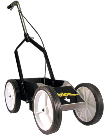
Traffic Machine SZ604

Designed exclusively for Stripe Traffic paints, this easy to use machine applies crisp, even 2"-4" lines on any hard surface. Holds 12 cans.