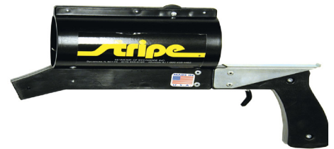
Marking Gun SZ605

For use with Stripe Athletic Field Marking paints. The same as the SZ604 except for its larger wheels, this machine allows application of lines between 2-4 inches on athletic fields and other turf surfaces.