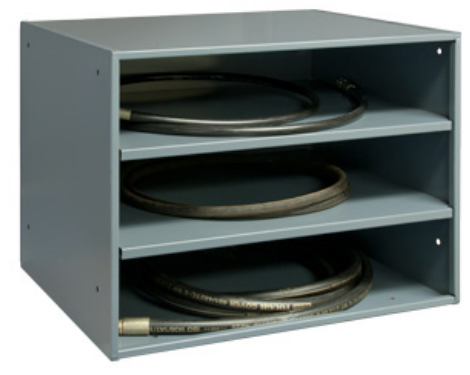
20"W X 15"H X 15 3/4"D PART NUMBER 00123032S95

Hydraulic Hose Cabinets - Triple Horizontal